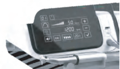
-Full touch 7 inch screen- Large size screen ensures that the treatment parameters are visible at any time