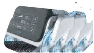
Built-in water supply system 4 shifts water supply up to 150ml/min