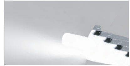
Fiber optic contra angle High brightness LED light source up to 30000lux