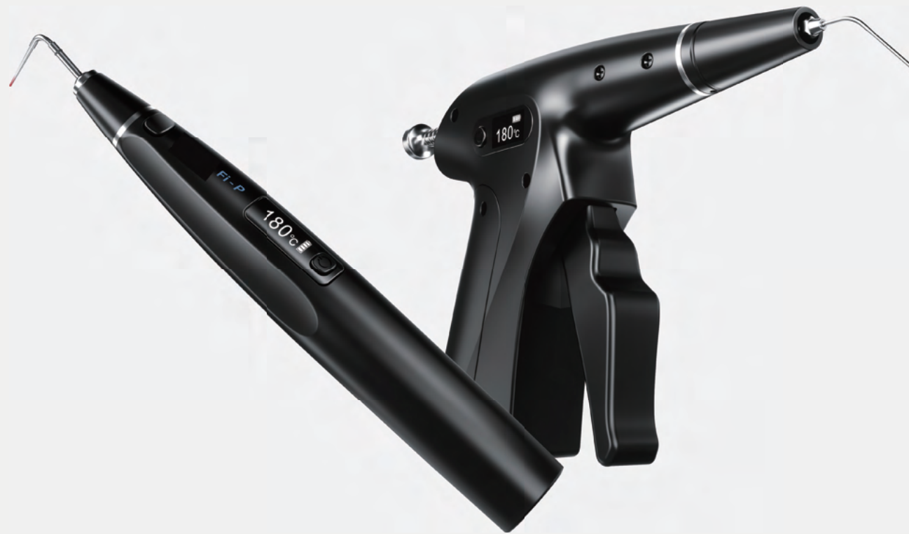
Fi-G: Time for 0°C-230°C (S)