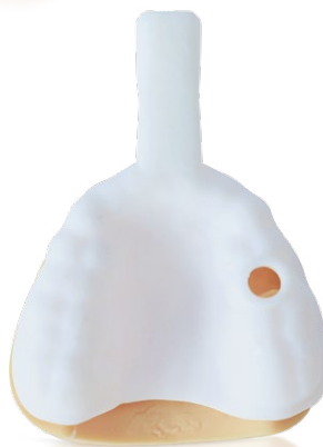
Customized Impression Tray