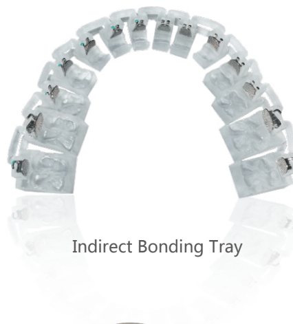
Indirect Bonding Tray